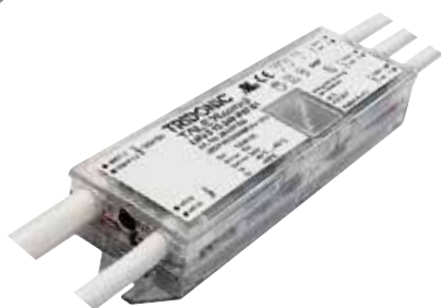
TALEXcontrol LNU S