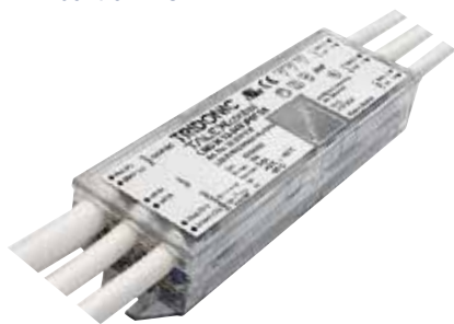
TALEXcontrol LNU M